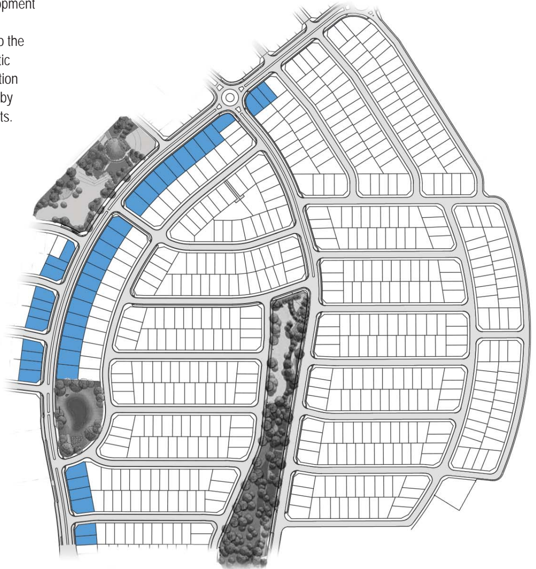
Figure 3: Lots Requiring Acoustic Treatment (Refer to Sale Documentation)

You should refer to the conditions of the development consent from Camden Council as they relate to the requirements for acoustic treatment. This information can be provided to you by Macarthur Developments.