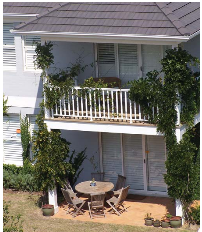
You can choose the approval pathway for your home

Note that only Council can approve a DA. Any variations to Council's DCP controls will need to be requested from Council and any variations to the controls are at Council's discretion.