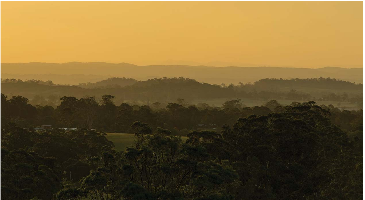
You should aim to maximise views from Emerald Hills wherever possible