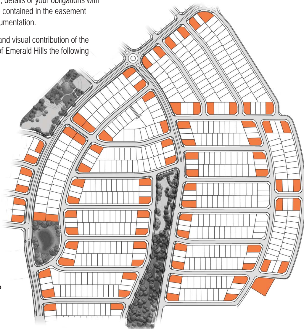
Figure 2: Visually Prominent Lots Where Estate Fencing on Side or Rear Boundaries has been Provided or is Required.

To maintain the integrity and visual contribution of the fencing to the character of Emerald Hills the following controls apply: