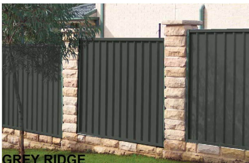
Illustration of Required Fencing with Base Course (if no retaining wall)