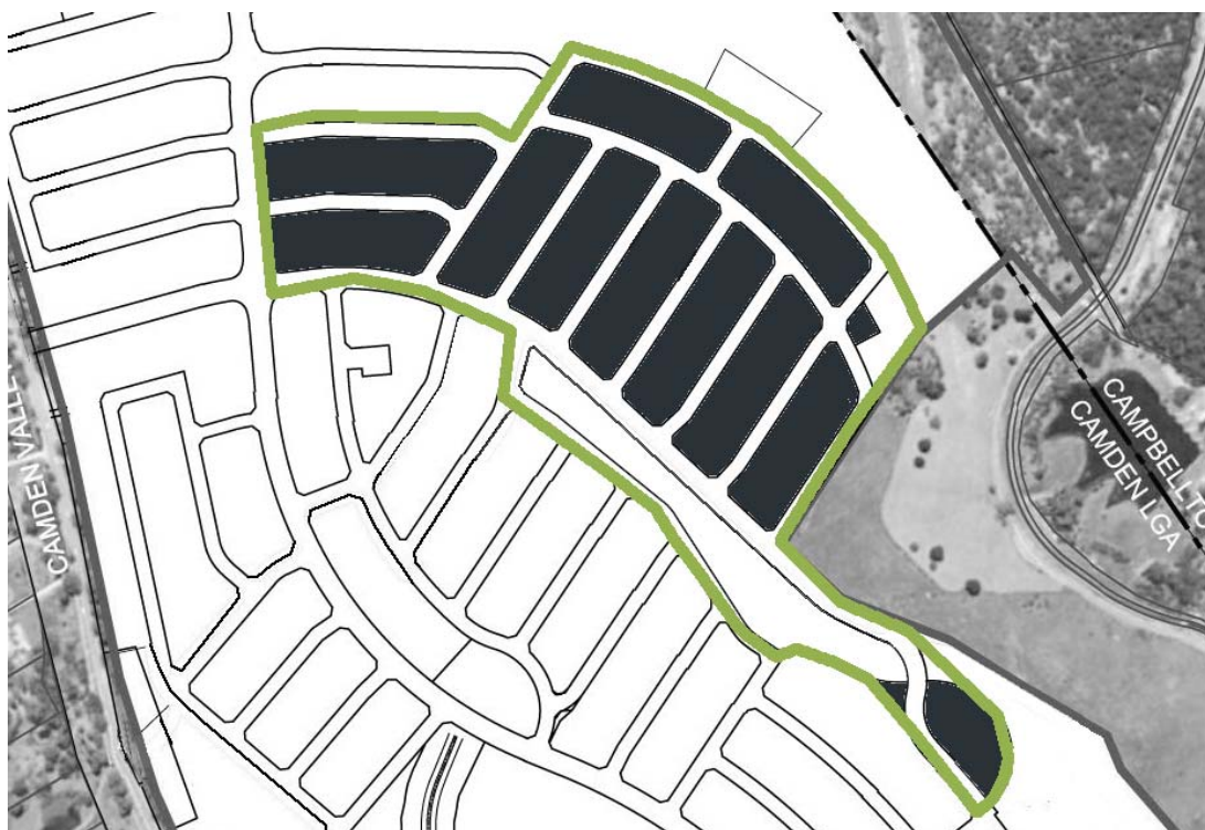
Figure 1: Building Style and Colour Control Area